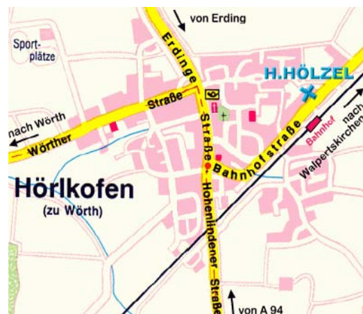
Map of Hörlkofen

H. Hölzel GmbH, Bahnhofstraße 23, 85457 Wörth/ Hörlkofen Tel.: 08122 / 9748 0