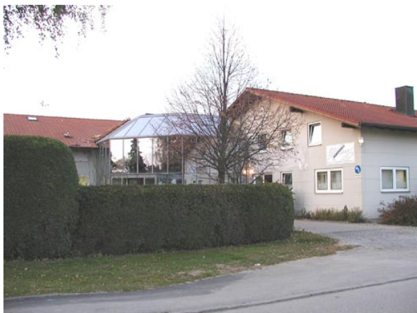
Thats Hölzel – (visitor's parking area)